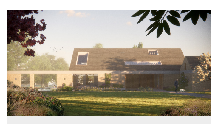
New house near Winchester, Hampshire - Replaces existing agricultural barns

This project replaces a collection of small agricultural barns, with a generous family house over two levels, with extensive grounds. A well thought-out design approach, coupled with sustainable building methods, has seen the creation of an impressive property that is respectful of its hilltop location and sympathetic to its agricultural heritage.