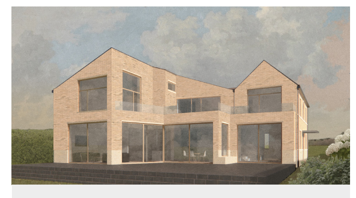
New house in Fetcham, Surrey - Replaces an existing bungalow on a generous suburban site

This stunning new-build multi-generational home required a particularly careful and considered approach to the design and planning as it is situated adjacent to a conservation area and a listed building. It is also has very high sustainability credentials, from well-insulated walls to a ground source heat pump and mechanical ventilation heat recovery system, in order to avoid reliance on conventional gas heating.