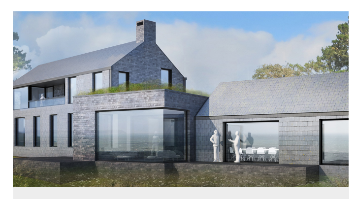
New house near Poluran, Cornwall - Clifftop location with panoramic sea views

This clifftop development exemplifies the enormous potential that can be achieved from acquiring parcels of land with an existing house to be replaced. Beginning with land acquisition, to obtaining planning consent, and then completion of construction – this is a prime model of what this Guide seeks to accomplish for those looking to build their own unique home.